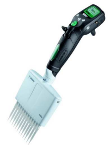
GILSON Concept 電動微量吸管