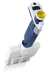
GILSON M 電動微量吸管